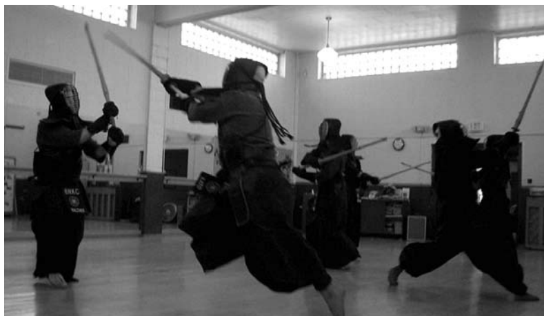
Students try to score “points” on their instructor during Kendo training.

Most young Americans know about Japan only through cars, comics, cartoons (anime), or grandparents who fought in World War II. As a result, the images of Japan for our students reduce to that of a high-tech industrial superpower, a place of