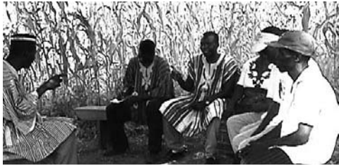
A rural male Ghanaian network discerning the issues of the day.

Findings and implications of this research for reproductive health policies in SSA were presented at the Population Association of America (PAA) Conference on April 30. A further extension of this work focuses on longitudinal data and has been accepted for presentation this September at the XXVI International Union for the Scientific Study of Population (IUSSP) International Population Conference in Marrakech, Morocco.