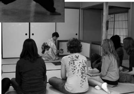
Students in Anthropology 294 at a tea ceremony.

learned that in spite of Japan being a traditionally hierarchical society, once you enter a tea room, everybody shares the moment of the experience equally. We learned that samurai warriors—who lived to face death—tried to calm their nerves by listening to the sounds of water boiling and tea being prepared. For most, this was the first time to experience