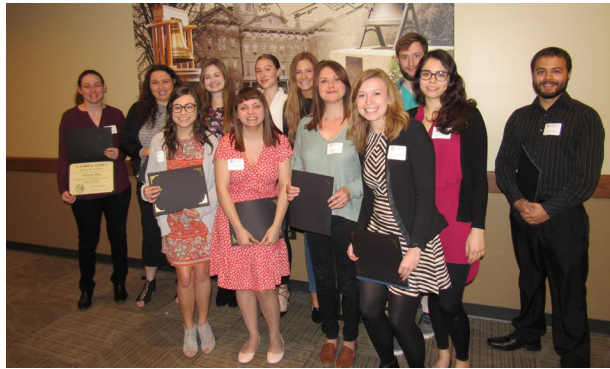
Ceremony inductees of Lambda Alpha, the National Collegiate Honors Society for anthropology.