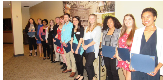
Honors students ceremony attendees.