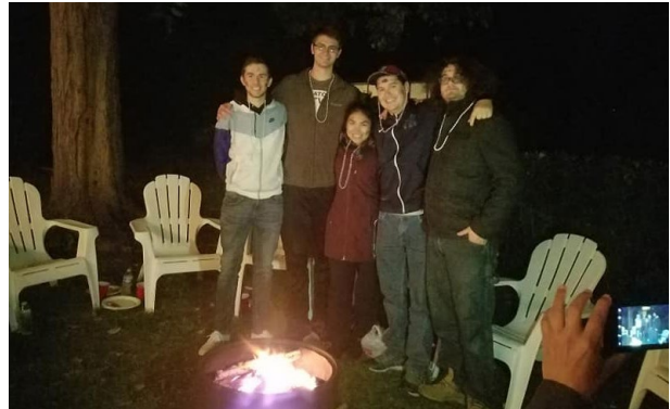
This year's traditional fall SOSA Initiation Ceremony.

For current updates on the Society of Student Anthropologists, please see the SOSA Facebook page.