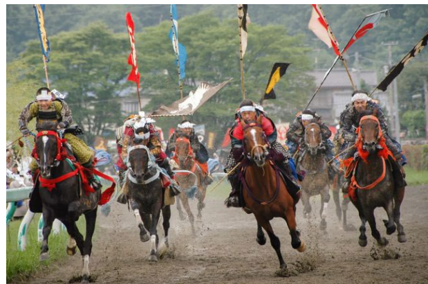
Fukushima’s Sōma horse festival from nippon.com .