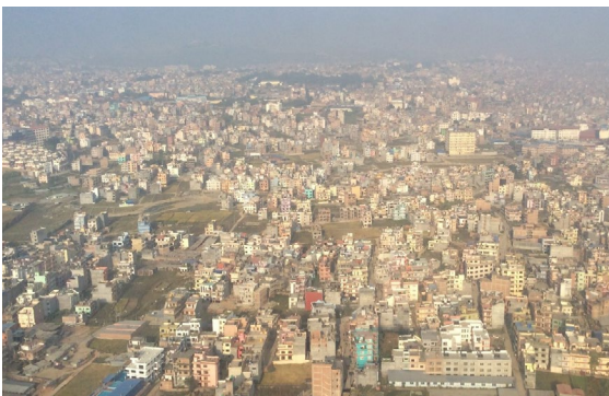
Kathmandu, Nepal, one of the most polluted cities in the world.

Our time overseas gave us a perspective on inequality beyond what we see in the U.S. Probably the starkest examples that we saw were in Nepal. Because we stayed there for almost two months, we were able to make friends and get to know more about the local context. Things we often take for granted in the U.S. are not a given there: clean water to drink, predictable trash pick-up, dependable electricity and internet services, warm showers, flush toilets, a variety of fresh produce, and clean air to breathe. There are structural reasons for this inequality that relate to governance and development, and sociology students often learn about these things in our comfortable classrooms. Living there, I experienced the lived effects of unregulated exhaust fumes and burned trash on my lungs and skin. In the picture below of Kathmandu, you can get a sense of how polluted the air is.