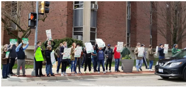
Locals 1110 and 3236 along with supportive faculty and students hold an informational picket along College Avenue.