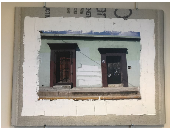
A piece from the 2017-2018 gallery exhibit, “As Fluid as a Brick Wall”.