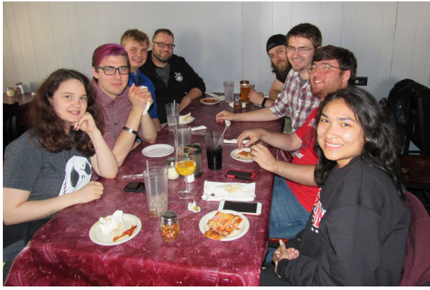
Annual Rites of Passage for anthropology program graduating seniors.