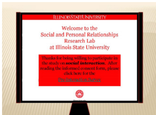
When participants first arrive, they complete an online survey.