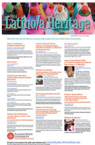
2014 Latino/a Heritage Calendar

The 2015-2016 academic year is off to a great start for the Latin American and Latina/o Studies Program as we